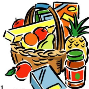
Thanksgiving Food Baskets

In early November the Health and Welfare Committee will be assembling food boxes to go to families within the congregation and local community. During the month of October the Peace Pantry will be collecting food items to be used in these boxes. The Health and Welfare Committee will be supplying a canned ham for each of these boxes and will be looking to the congregation for some canned fruits and vegetables, boxes of potatoes or stuffing, canned potatoes, pasta, sauce, cereal